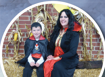
Mummy/Son Date Night (Pg. 4)