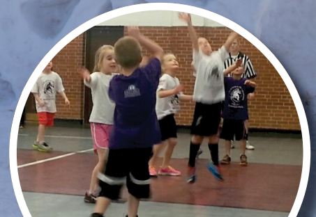
K-2nd Grade Youth Basketball (Pg. 2)