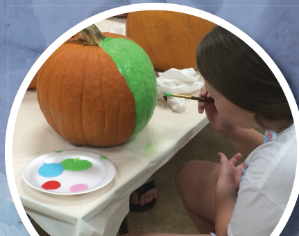
Pumpkin Painting (Pg. 3)